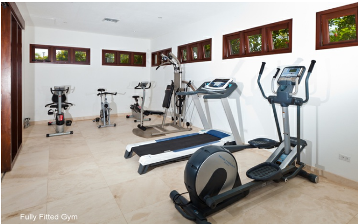
Fully Fitted Gym