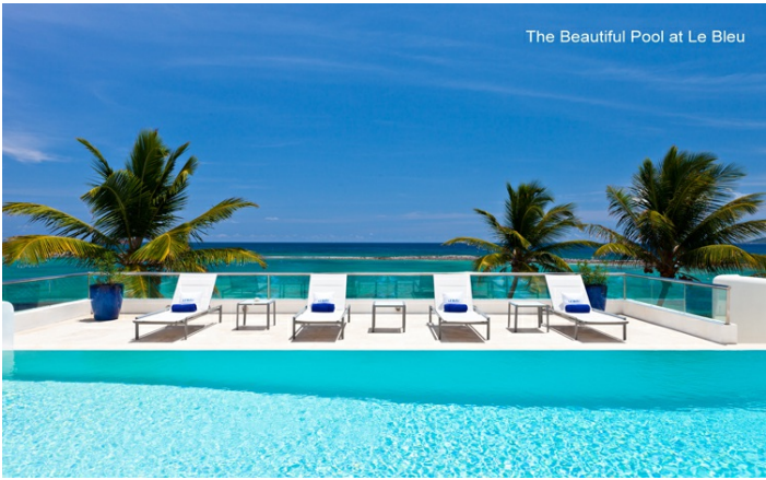
The Beautiful Pool at Le Bleu