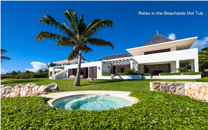
Relax in the Beachside Hot Tub