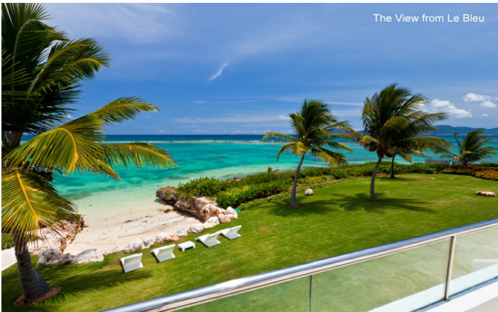
The View from Le Bleu