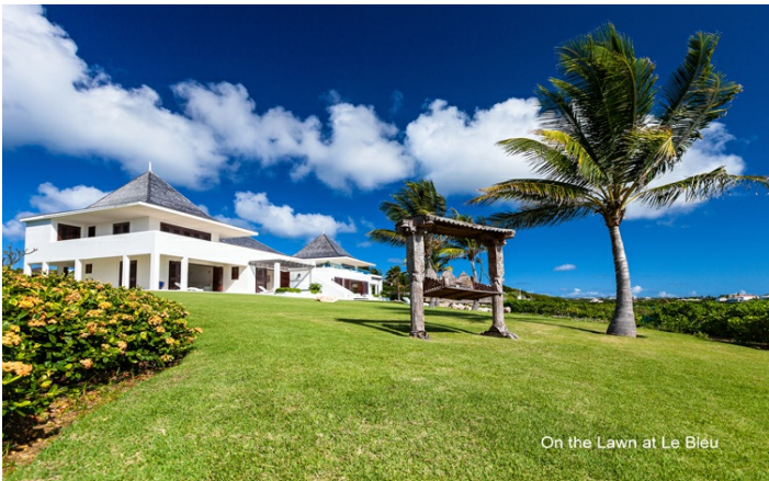
On the Lawn at Le Bleu