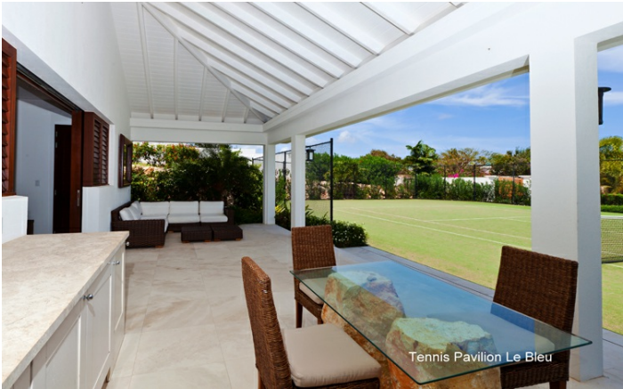
Tennis Pavilion Le Bleu