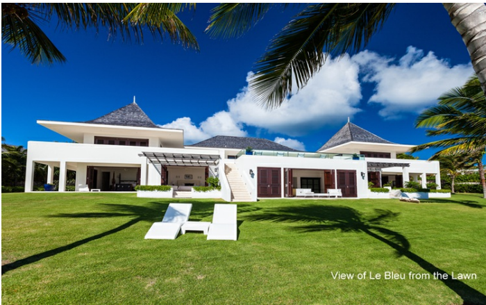
View of Le Bleu from the Lawn