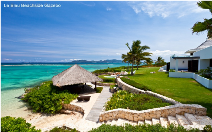
Le Bleu Beachside Gazebo